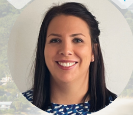
She/Her/ia Ngāi Tahu RN Prescriber in Diabetes Health