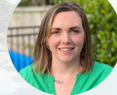
She/Her Pākehā RN Prescriber in Primary care and specialty teams