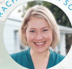
She/Her Pākehā RN Prescriber in Diabetes Health